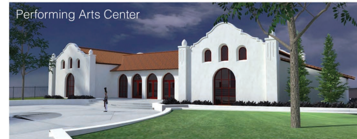
Performing Arts Center

Learn, first-hand, about the exciting opportunities the Duffield Sports Center and other Master Plan planned facilities will offer our cadets. Get a behind-the-scenes look at the new and proposed facilities and learn about the drive for Warrior Pride that is guiding this development of the project.